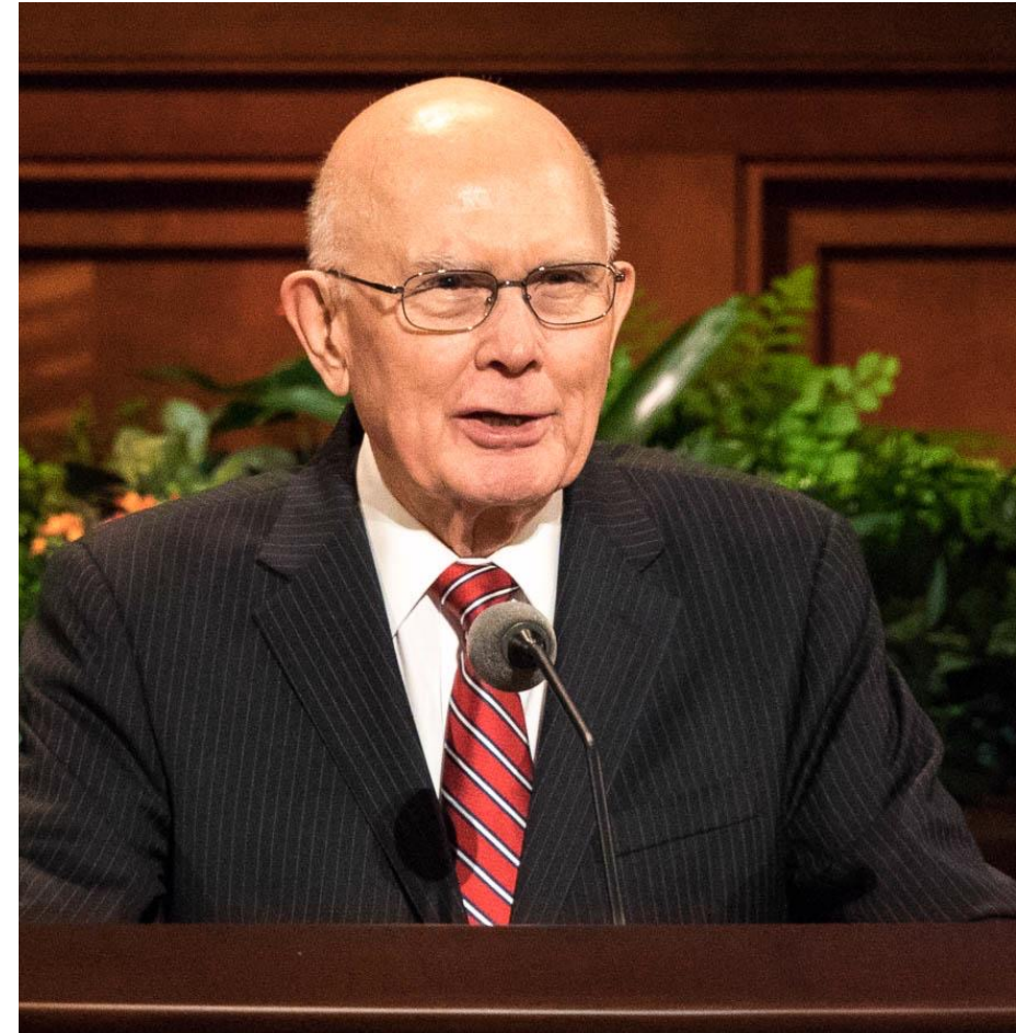
Elder Dallin H. Oaks Special Witnesses of Christ April 2001

“We are commanded to repent of our sins and to come to the Lord with a broken heart and a contrite spirit and partake of the sacrament. ... We witness that we are willing to take upon us the name of Jesus Christ and always remember Him and keep His commandments. When we comply with this covenant, the Lord renews the cleansing effect of our baptism. We are made clean and can always have His Spirit to be with us.”