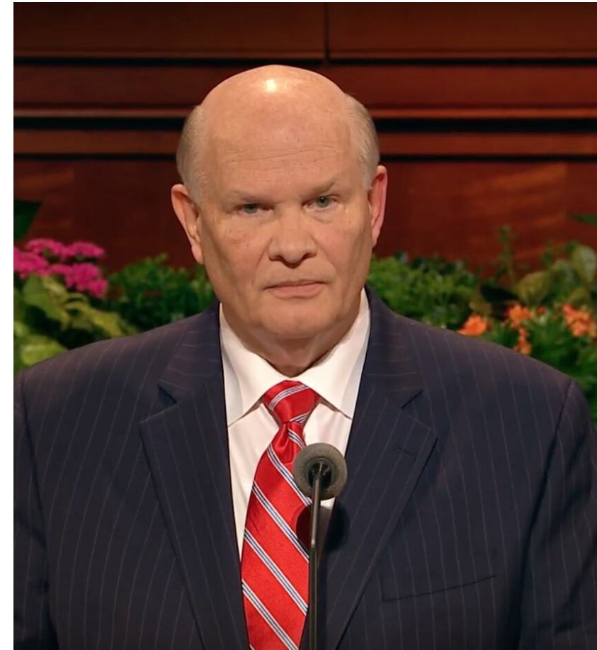
Elder Dale G. Renlund 2021 Seminar for New Mission Presidents

“Ultimately, whether missionaries remain converted throughout their lifetimes depends on their determination to be engaged with the doctrine of Christ.”