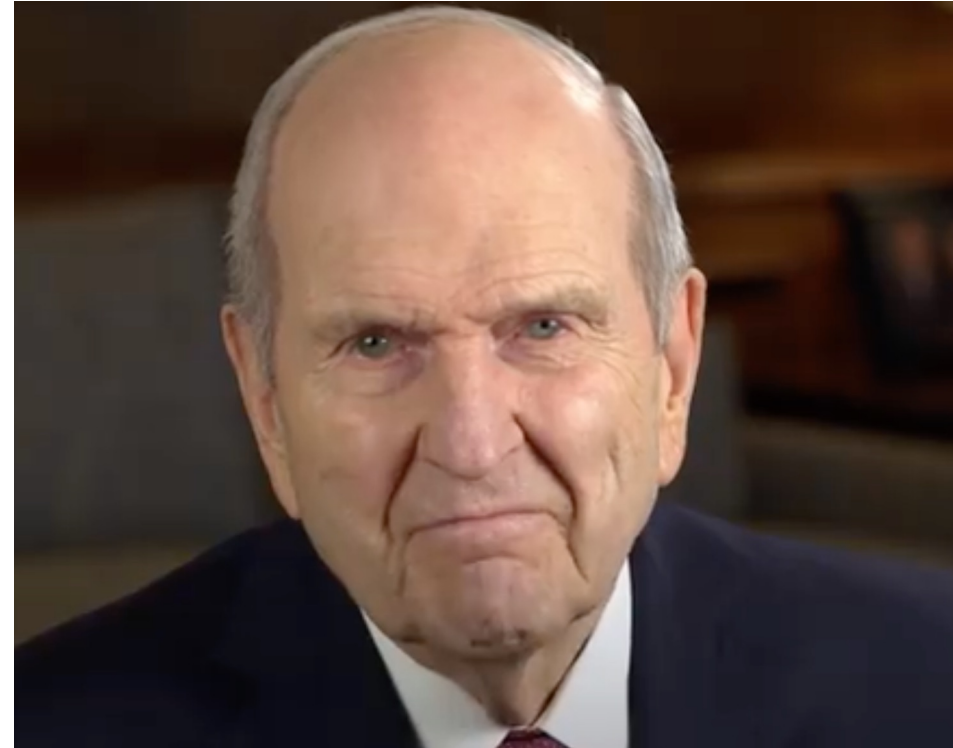
President Russell M. Nelson

“My dear brothers and sisters, this should not be. As disciples of Jesus Christ, we are to be examples of how to interact with others—especially when we have differences of opinion. One of the easiest ways to identify a true follower of Jesus Christ is how compassionately that person treats other people.”