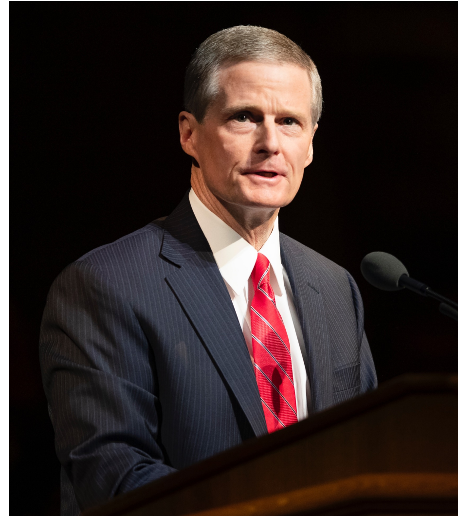
Elder David A. Bednar 2013 Seminar for New Mission Presidents

“The time has come for us to capitalize more effectively on the potent combination of the mighty change of heart, made possible primarily by the spiritual power of the Book of Mormon, and the turning of hearts to the fathers, accomplished through the spirit of Elijah.”